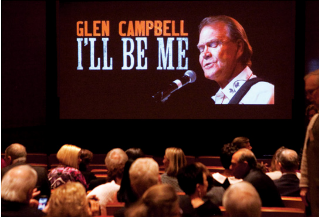
A VIP reception and screening of “Glen Campbell— I’ll Be Me” was hosted at the Cincinnati Art Museum.