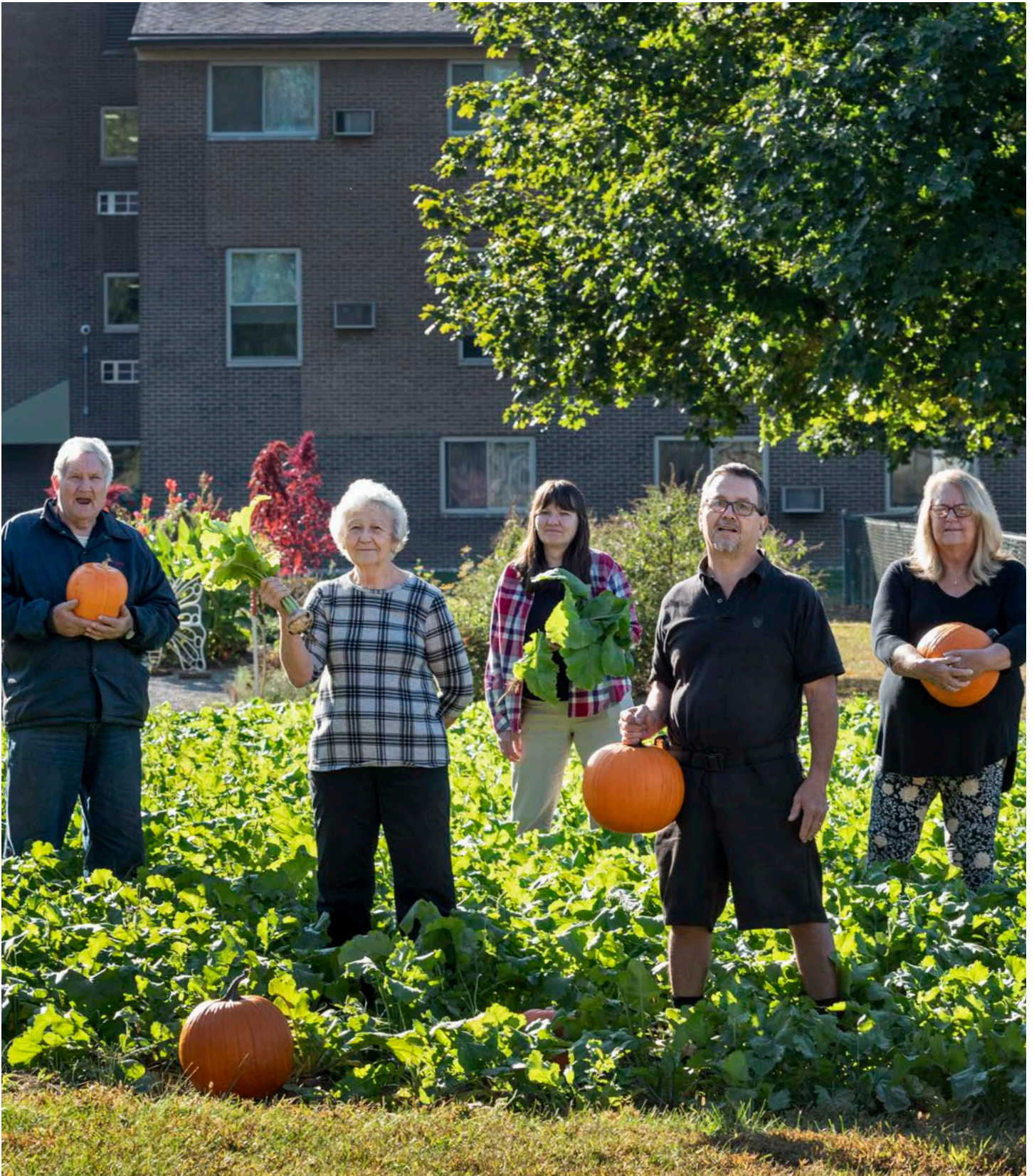
Staff and residents of Canterbury Court in West Carrollton, Ohio, proudly share the bounty of their community garden with their neighbors.