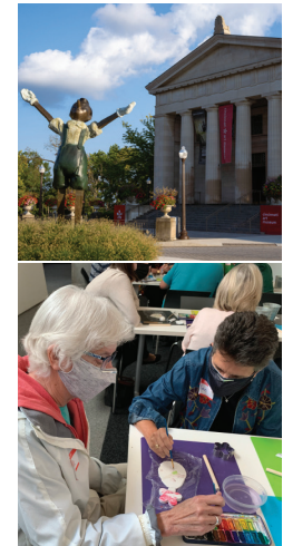
AT THE CINCINNATI ART MUSEUM