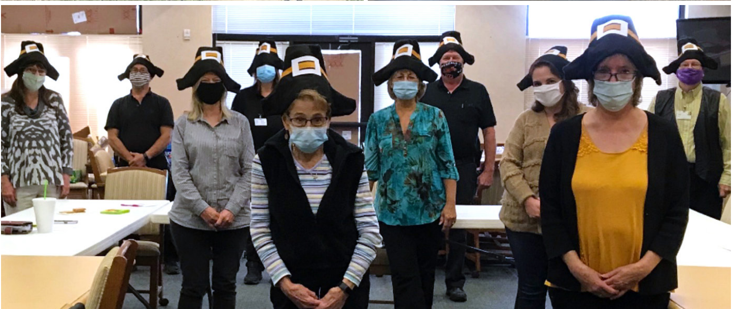
From top left: They weren't all bad days in 2020, sunny days and rainy nights caused a growth spurt in St. Paul Village's community garden! To keep each other going, residents wrote words of inspiration and advice to post on social media. Canterbury Court staff enjoyed serving the residents a delicious Thanksgiving dinner!