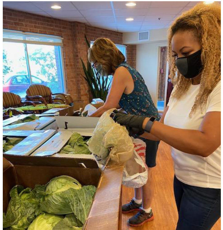
Thanks to ERS support and affordable living teams for volunteering to do the extra work and keep residents safe.

The Freestore Foodbank delivered fresh produce to St. Paul Village again in 2020. The visits required volunteers willing to pre-bag all vegetables and fruits to keep residents safe when they came to pick up their items. Bagged produce went to several Cincinnati area communities and residents who signed up at St. Paul Village. ERS support staff and affordable living staff did the extra work to keep residents safe.