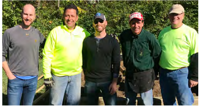
Team members from The Model Group and ERS worked together to build raised garden beds for residents at The Elberon.